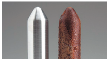
PURITY FG Specialty Chemical Company

Unlike a leading chemical company's fluid, PURITY FG Trolley Fluid passes the demanding ASTM rust test (Sequence A & B). This strong level of corrosion protection can extend equipment life in the wettest operating conditions while protecting food products from rust contact.